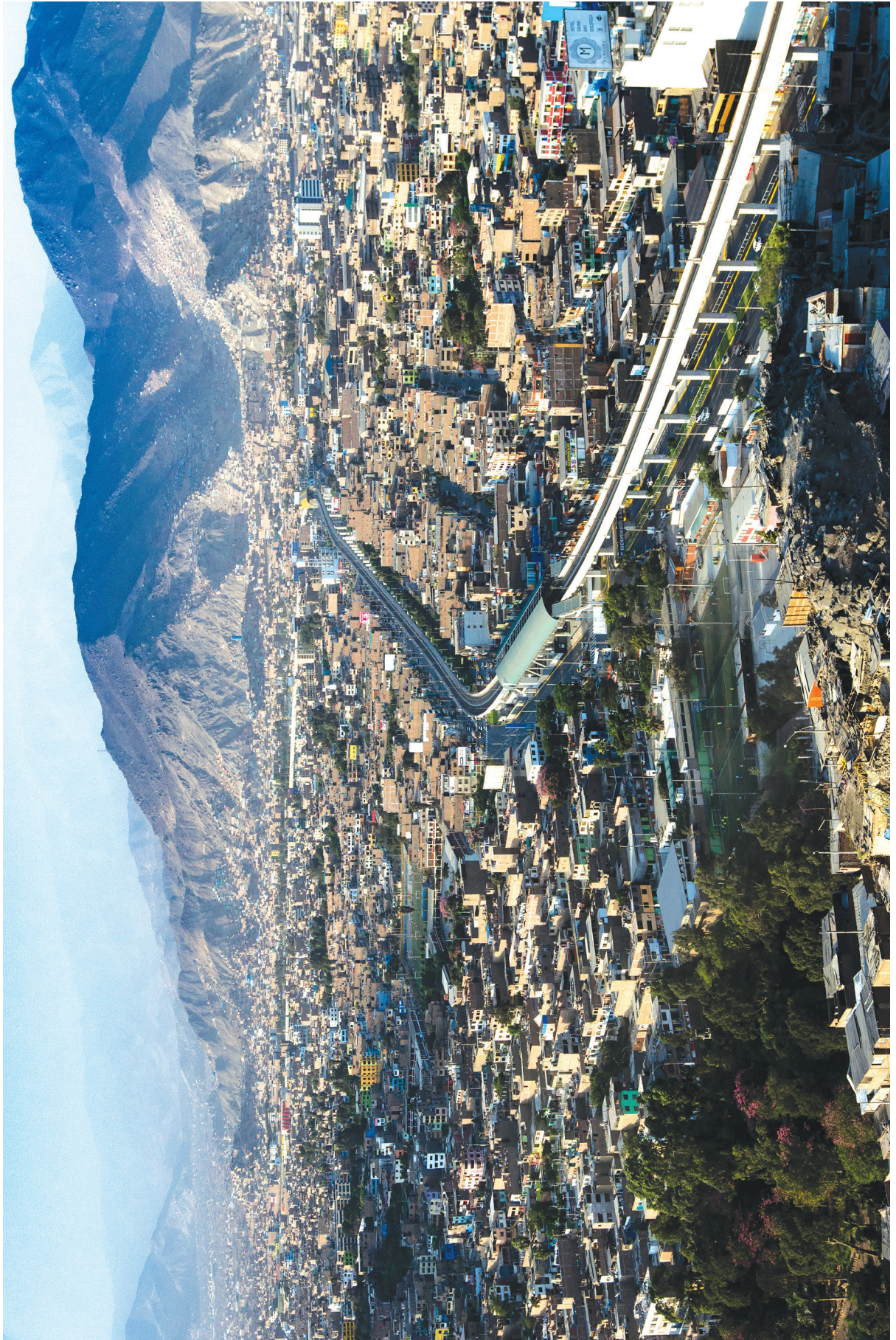
Fig. 3.1 for Question 3 The Metro de Lima, a railway in Lima, Peru, an MIC in South America